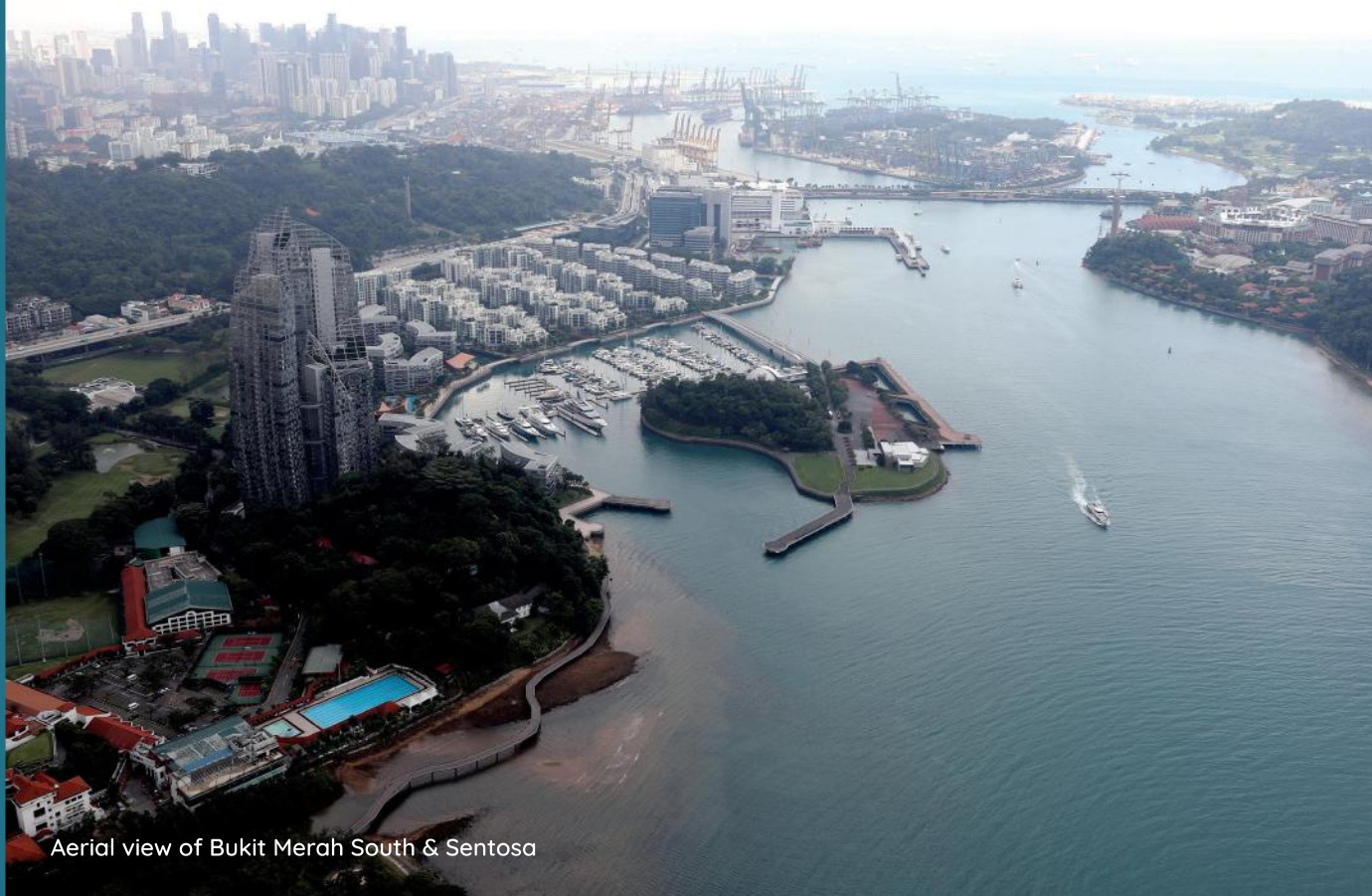
Aerial view of Bukit Merah South & Sentosa

Our towns are planned to be liveable and self-sufficient, with easily accessible shops, health care, schools, community facilities and parks. Commercial nodes, industrial estates and business parks within or nearby the town, also help to provide nearer job opportunities for residents. The detailed planning and implementation of plans for each town is a joint effort of many government agencies.